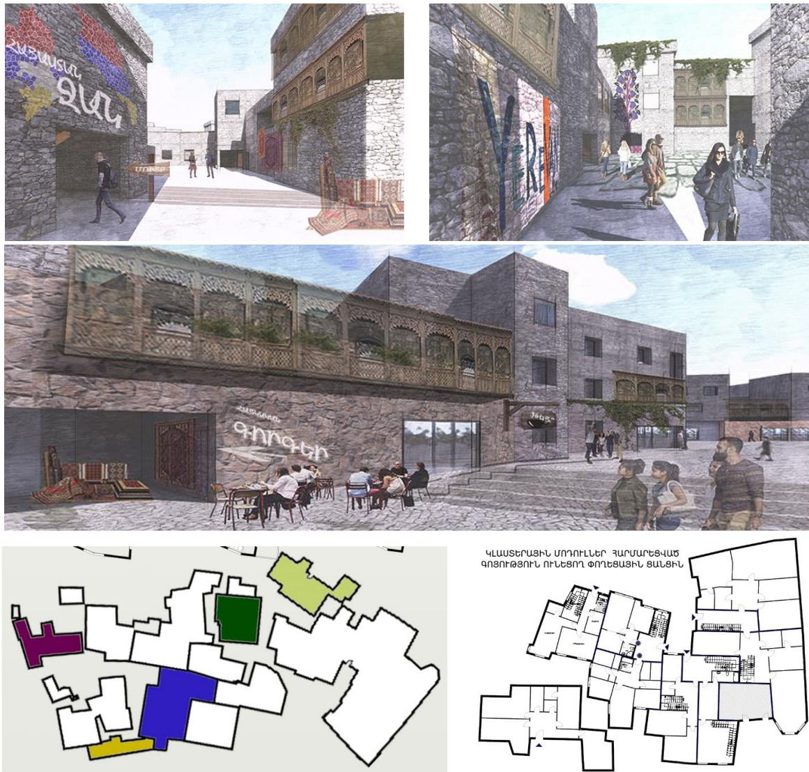
Figure 5. Concept of the "Kond" revalorization: environmental images (from the materials of the project that took first place with the highest scores in the competition).