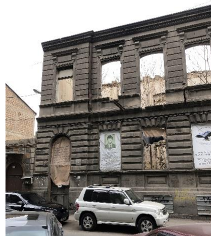
Figure 1. Old historical structures that are still preserved in the city center of Yerevan.