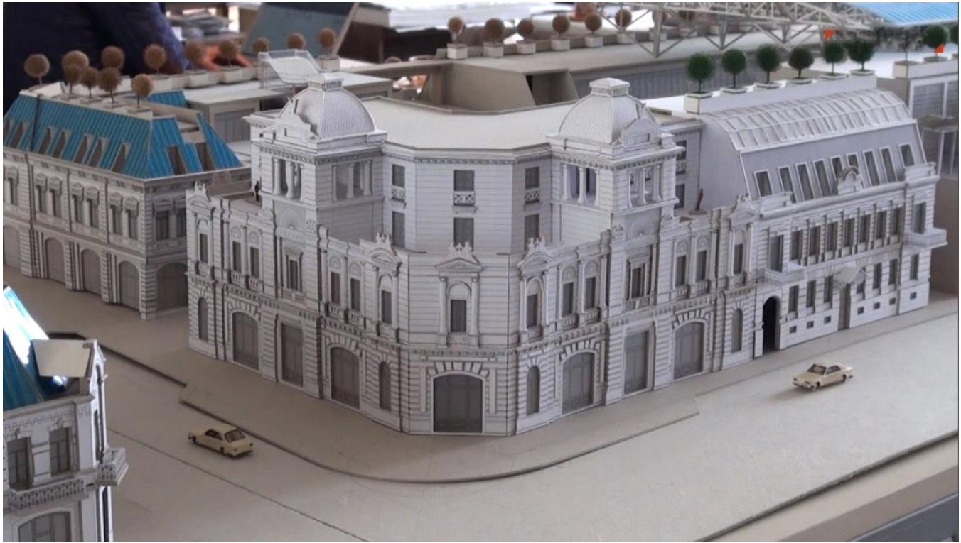
Figure 3. Model of "Old Yerevan" project.