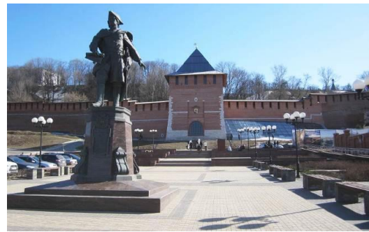
Figure 4. Monument to Peter the Great. Sculptor: A. Schitov, architect: S. Shorokhov (2014).

The monument to Peter the Great (sculptor Aleksey Schitov, architect Sergey Shorokhov, 2014) is located on the Nizhnevolzhskaya Embankment, in the square in front of the Conception Tower of the Nizhny Novgorod Kremlin. The monument is an accent on this section of the embankment, organizing an outpost in front of the entrance to the Kremlin (Fig. 4).