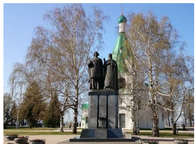
Figure 3. Monument to Prince Georgy Vsevolodovich and Bishop Simon of Suzdal. Sculptor: V. Purikhov, architect: V. Voronkov (2008).

The sculpture is a two-figure composition, which, according to the idea of the authors (sculptor Viktor Purikhov, architect Vadim Voronkov) symbolizes the unity of worldly and spiritual life principles. The sculpture's location against the background of the most ancient temple of the Nizhny Novgorod region has a semantic meaning: the bronze figures should be perceived as coming from the Orthodox Church towards the visitors of the Nizhny Novgorod Kremlin. The height of the monument together with the pedestal is 7.5m. The figures in the paired sculptural group are designed on contrast, which does not interfere with its holistic perception. The bishop's raised right hand, with which he blesses the new city, is located in the geometric center of the monument, which gives the idea a special meaning. The bronze figures are mounted on a pedestal of prismatic shape, lined with slabs of light gray granite. Two thin vertical niches and the upper belt are made of black granite. A granite pedestal on a low plinth narrows upwards, giving dynamics to the overall composition. At the bottom on the front side of the pedestal, on a light gray volume protruding from a dark gray pedestal, there is a bronze cartouche with the inscription: "To the founder of the city, St. Grand Duke Georgy Vsevolodovich and his mentor, St. Simon from Nizhny Novgorod citizens" (Fig. 3).