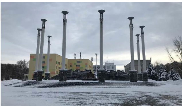
Figure 2. Memorial "Victory of 1945" in Marshal Zhukov Square. Architect: S. Timofeev (2000).