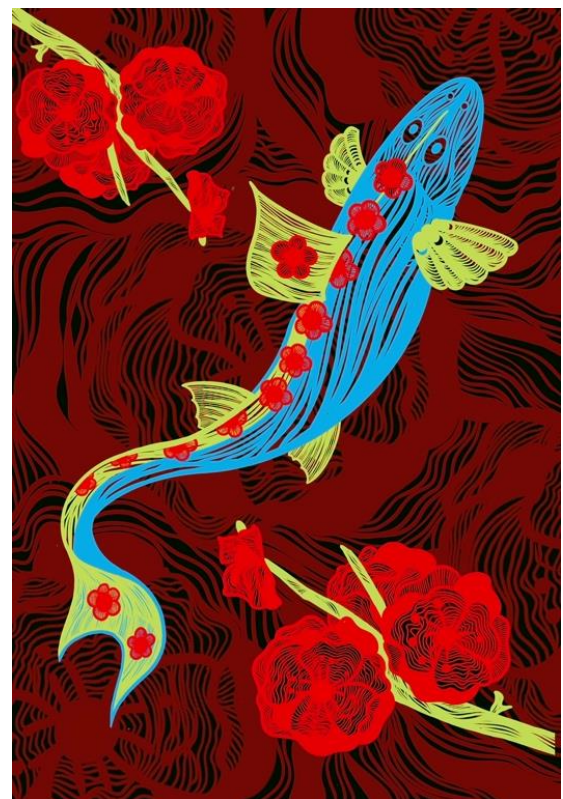
Figure 7. "Plum blossom shark".