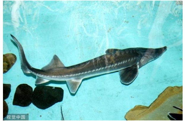
Figure 2. Picture of creatures shot in reality.