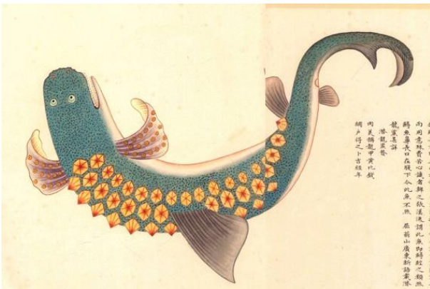
Figure 1. Illustration elements in the book (from [6], V2).

On the one hand, it can be seen from the illustration elements of some real marine creatures in "Catalog of Marine Creatures" that they tend to depict the original appearance of marine creatures in terms of shape and color. The Acipenser Sinensis (it is the Chinese sturgeon now) in "Catalog of Marine Creatures" is taken as an example for analysis. As the illustration elements in "Catalog of Marine Creatures" (Fig. 1) are compared with the real biological pictures (Fig. 2), it can be found that there is little difference between the shape in "Catalog of Marine Creatures" drawn by Nie Huang and the real object when creating the illustration. That is to say, Nie Huang followed the original color and shape of the real object when he drew the biological object. From this point of view, the purpose of catalog is to help people see more, and it is not a free creation completely divorced from reality.