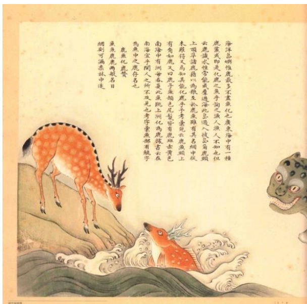
Figure 4. "Deer fish turns into deer" (from [6], Vol. 3).

In addition, a considerable part of the illustration elements in "Catalog of Marine Creatures" were created under the influence of the biological thought of the ancient theory of metamorphosis, such as the "deer fish turning into deer" (Fig. 4) and the "Zha fish turning into the gull" (Fig. 5) in "Catalog of Marine Creatures". The ancients believed that there were four basic ways of reproduction of creatures, namely, vivipation, oviparity, Samsvedaja and metaplasia. Most of the metaplasia illustrations depicted in "Catalog of Marine Creatures" were about the transformation of one kind of creature into another kind of creature, which was very magical. At the same time, such illustration elements were also full of traditional Chinese ideology and culture, providing rich elements for the creation of modern book illustrations to a certain extent.