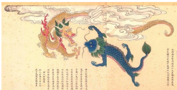
Figure 3. Illustration of Quzhuake dragon (from [6], Vol. 1).

In addition, a considerable part of the illustration elements in "Catalog of Marine Creatures" were created under the influence of the biological thought of the ancient theory of metamorphosis, such as the "deer fish turning into deer" (Fig. 4) and the "Zha fish turning into the gull" (Fig. 5) in "Catalog of Marine Creatures". The ancients believed that there were four basic ways of reproduction of creatures, namely, vivipation, oviparity, Samsvedaja and metaplasia. Most of the metaplasia illustrations depicted in "Catalog of Marine Creatures" were about the transformation of one kind of creature into another kind of creature, which was very magical. At the same time, such illustration elements were also full of traditional Chinese ideology and culture, providing rich elements for the creation of modern book illustrations to a certain extent.