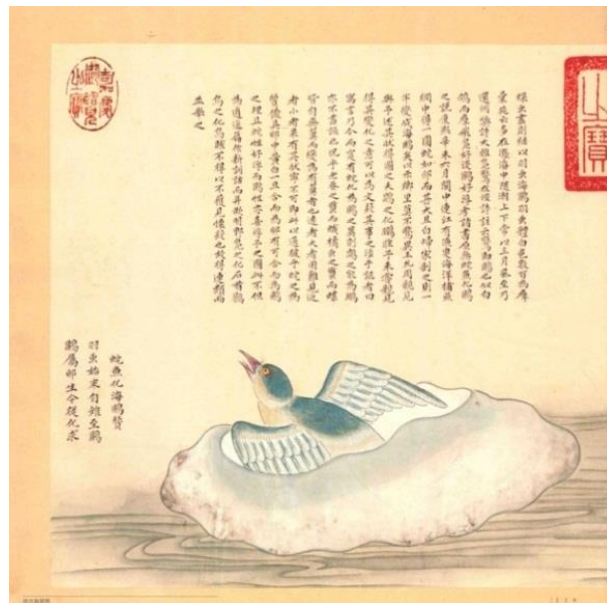
Figure 5. "Zha" fish turns into seagull (from [6], Vol. 3).